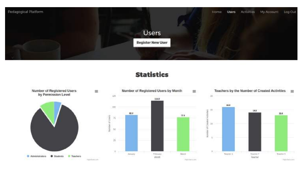
Figure 3. Administrators will be able to create new users (students, teachers, and administrators), and will have access to statistics about the registered users.

Figure 2. On the proposed platform, teachers will be able to choose if their activities will be public or private. Public activities will be available to all students registered on the platform, and the private ones will be only accessible through a code.